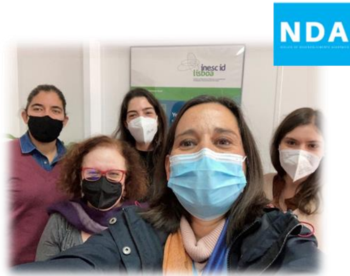
Figure 3. Mental Health Seminar.